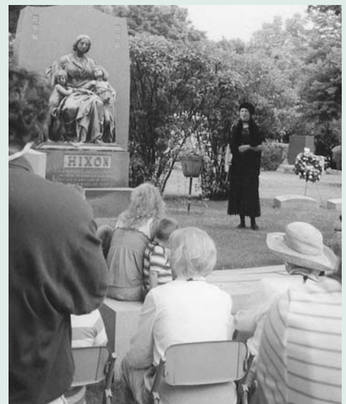
Hixon Family watching an actress portray Alice Green Hixon.

Of course, YOU can celebrate the history in Oak Grove Cemetery - stop in and let us show you around.