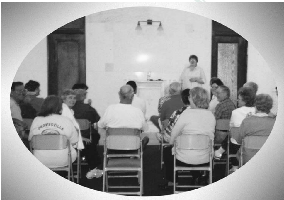
The La Crosse Area Genealogy Society visited Oak Grove on May 24. The group listened to a presentation on the historic mausoleum and reviewed cemetery resources that would aid in genealogy research.