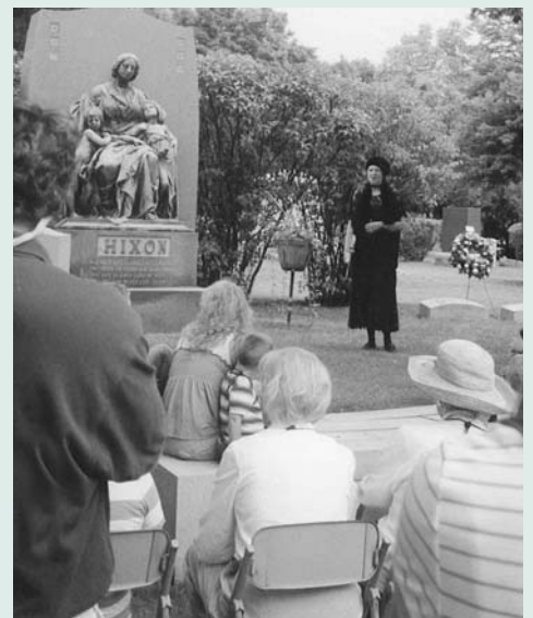
Hixon Family watching an actress portray Alice Green Hixon.

Of course, YOU can celebrate the history in Oak Grove Cemetery - stop in and let us show you around.