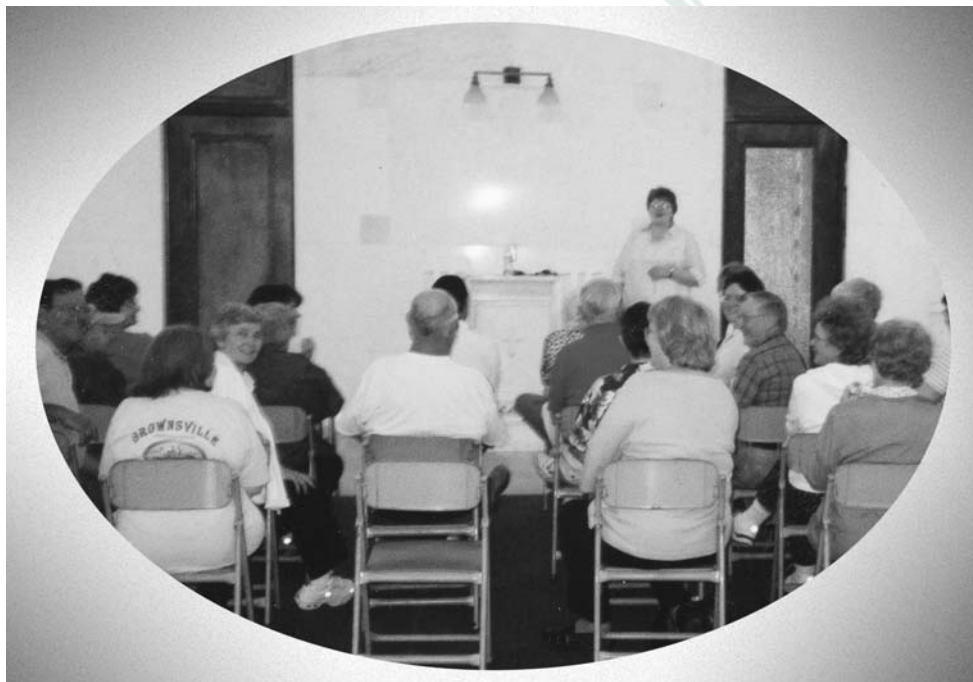
The La Crosse Area Genealogy Society visited Oak Grove on May 24. The group listened to a presentation on the historic mausoleum and reviewed cemetery resources that would aid in genealogy research.